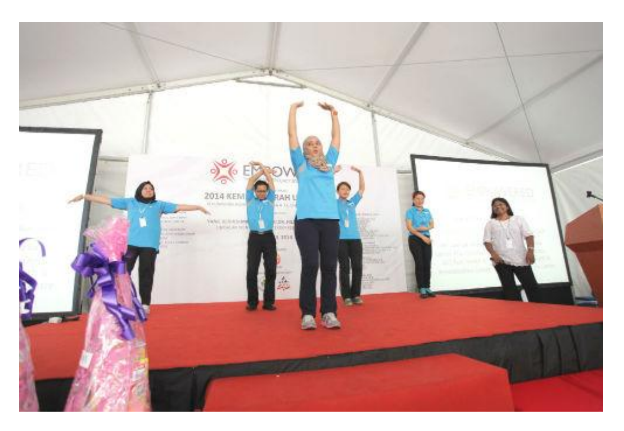
Aerobic exercises presented by the WQ Health Park & Rehabilitation Centre team during EMPOWERED's Awareness Day's Lifestyle Session