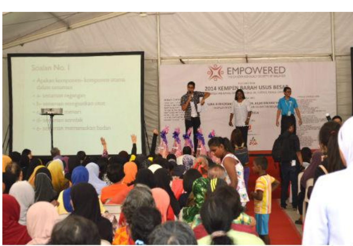
During the quiz & prize session for EMPOWERED's Awareness Day's Lifestyle Session

EMPOWERED's Awareness Day was indeed very well-organized. The working crew members are very sincere and the credit goes over to those involved.